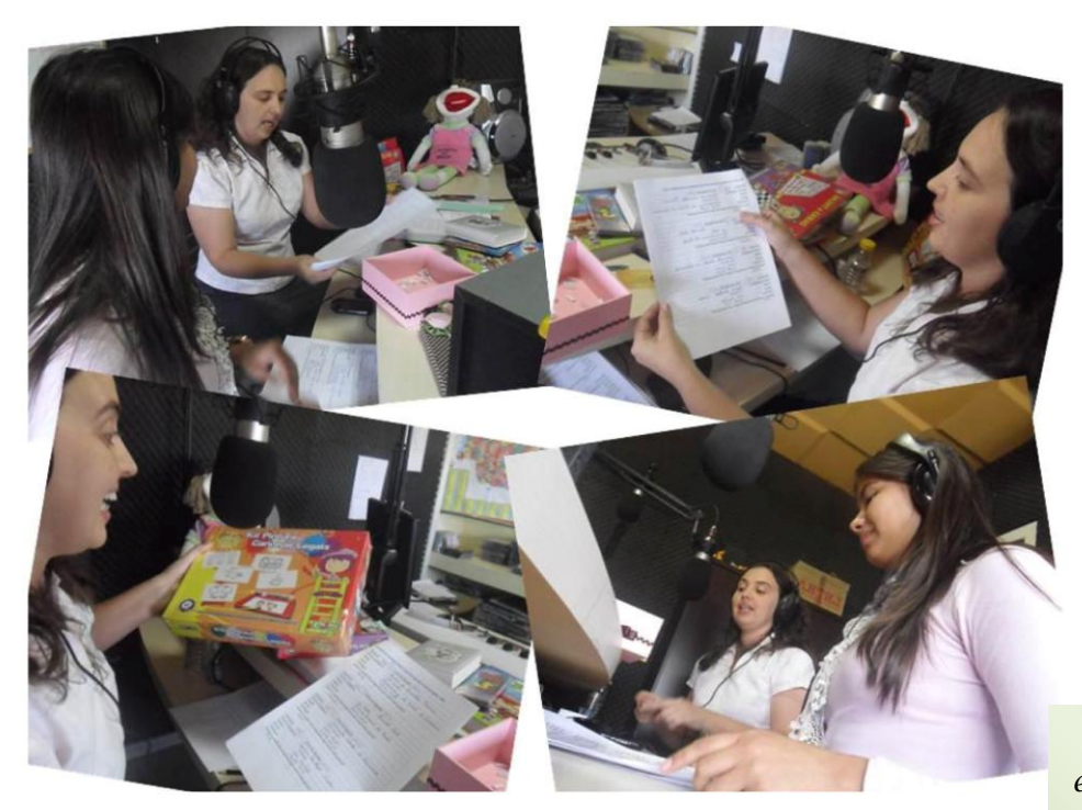
The Radio Show especially focused on 4-14ers challenging them to make a difference in the world