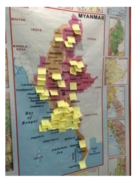
Final map of commitments for transformation