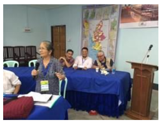
Lady sharing how God led her to build model village

The delegates saw how, from a historical perspective, transformation of countries comes from movements, not just programs. And how these movements came from local models of real transformation that were self sustaining, self led and self propagating. These models would immediately impact the cluster of villages around them and eventually the whole region. Various delegates shared their experiences in rural village model development and the power of community based development amongst the poorest of the poor. One village built their own path thru the wilderness that was 17 miles long! Another one built their own bridge. One pastor shared how no one respected him in the majority Buddhist village. Then he started helping them to learn about community health. Then they built a library together for the children, etc. As a result, the village respected the pastor, placed him on village leadership committees, and now the village is wide open to the Good News of Jesus.